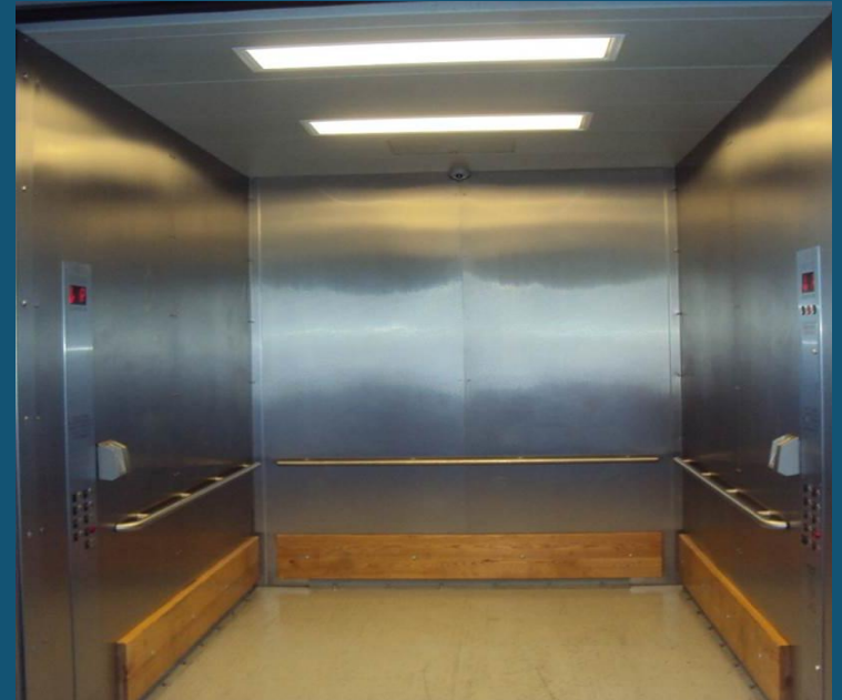
CTE Freight Elevator