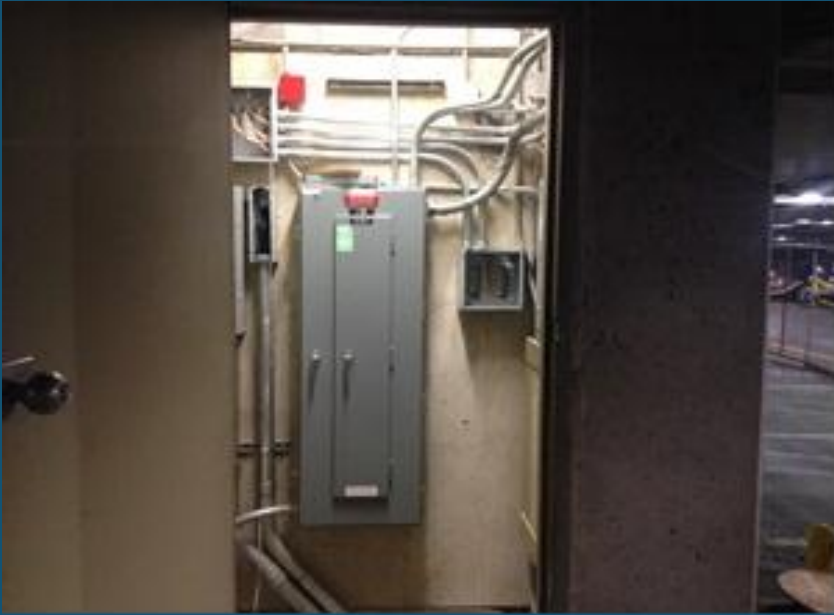
Emergency Lighting – Closets