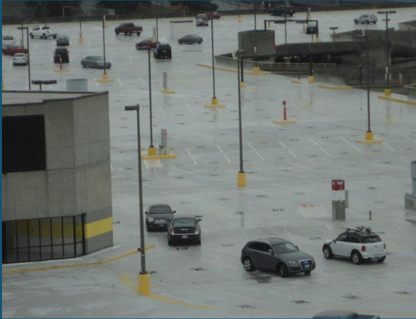
8 th Floor Weather proofing