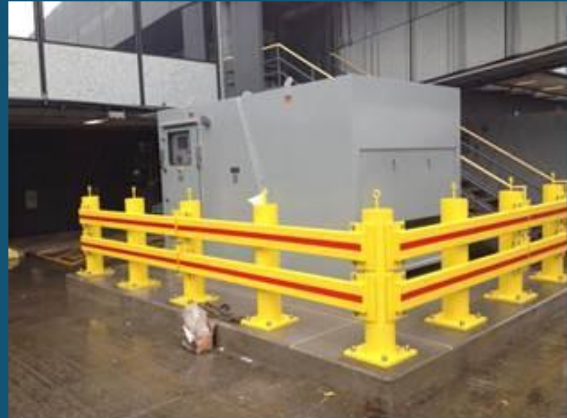
Gate Utility Improvements