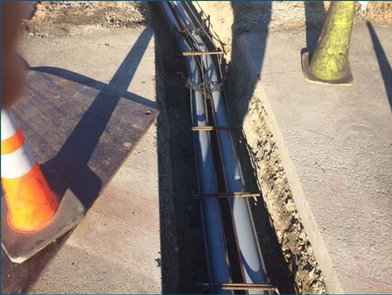
Industrial Waste Treatment Plant Fiber Installation